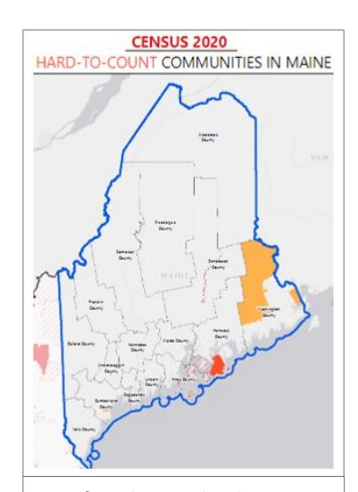
See if you live in a hard to count area: <u>Hard to Count Map</u> (click and zoom in)

Additional communities at risk for an undercount in 2020 include: Augusta, Auburn, Biddeford, Greater Bangor, Presque Isle, Sanford, Waterville.